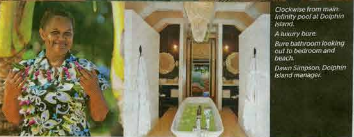
Clockwise from main: Infinity pool at Dolphin Island.